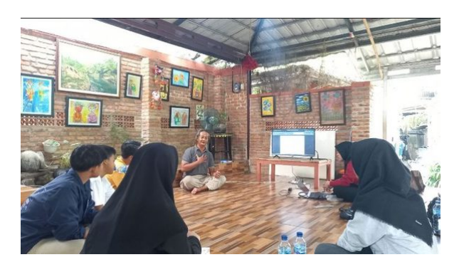
Documentary Filmmaking Workshop on 19th of March.